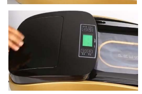
Press foot area once. Film moves forward., close the back cover SCM is ready to use