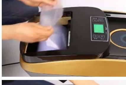
Feed the foil into the device (see arrows at the slot)