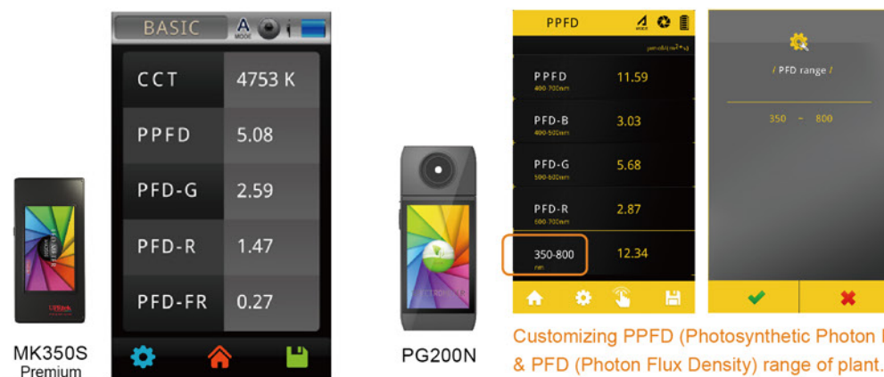
Customizing PPFD (Photosynthetic Photon Flux Density) & PFD (Photon Flux Density) range of plant.