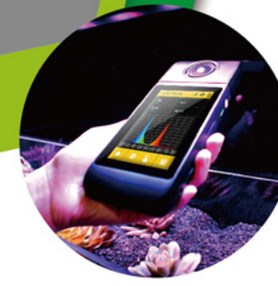
▲ Stand-alone Measurement

Multiple measurement solution provider, unlimited capturing the real light output, and making effective communication with customers.