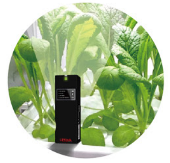
▲ Automatic Equipment System built-in Measurement