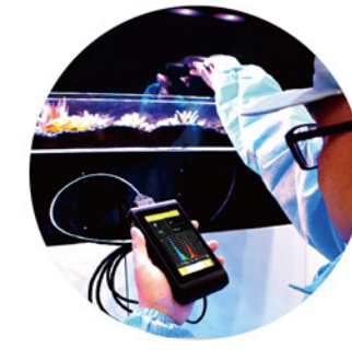
▲ Remote Measurement: USB Type C cable A removable sensor head can be set up in the Plant Growth Chambers and measure the Led growth lights conveniently.