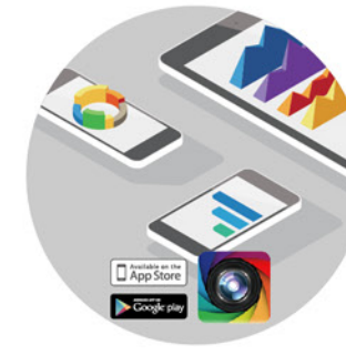
▲ APP Measurement PC SW Measurement